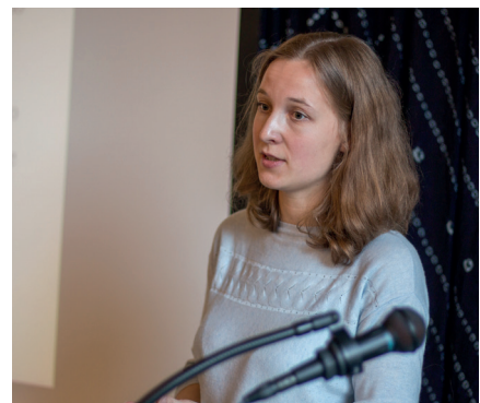
WI RUSSIA PROJECT