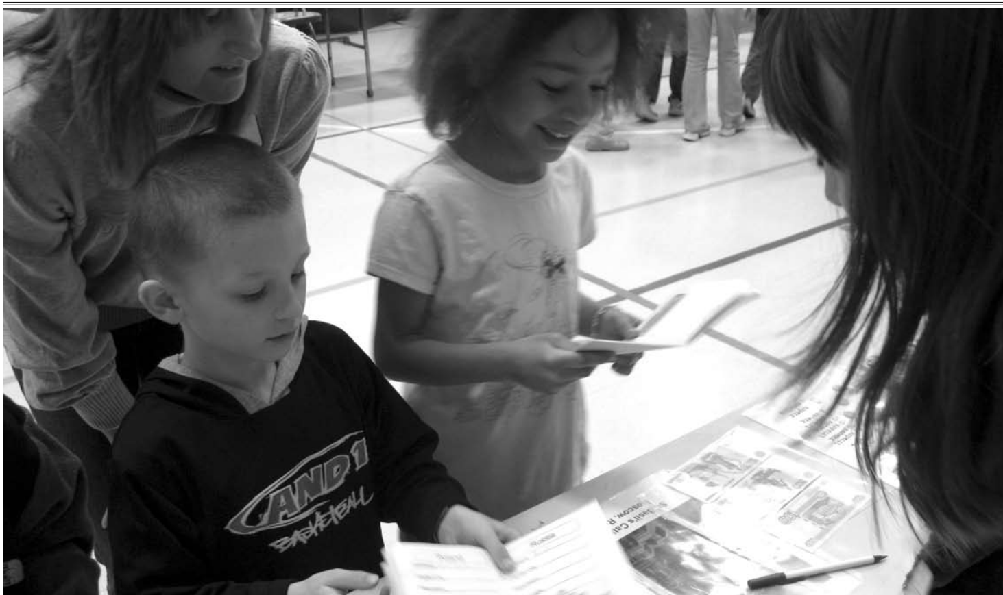
Students have their names written in Cyrillic at the Russian table during "International Day."