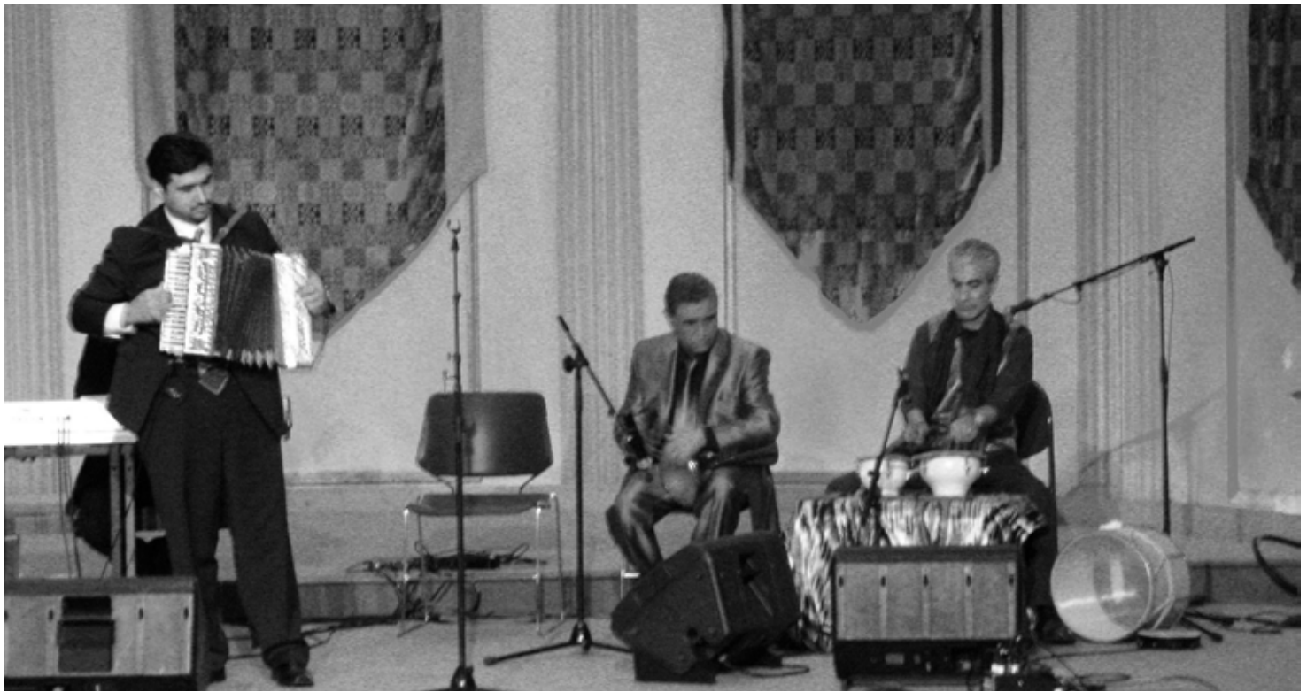
The Silk Road Ensemble performs for a large crowd in the Great Hall of Memorial Union.