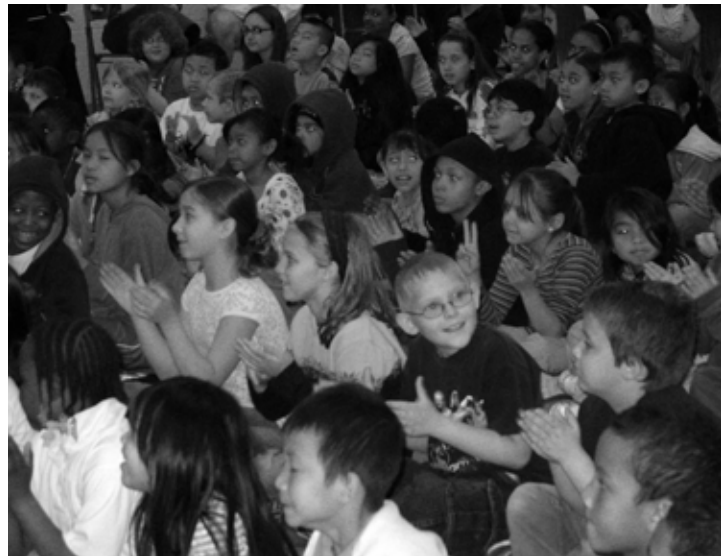
Lindbergh Elementary School students enjoy the music of the Silk Road Ensemble.

That evening, the quartet played to a large crowd in the Great Hall of the Memorial Union, offering up a musical and cultural journey along the traditional Silk Road that featured numbers from Afghanistan to Turkey. Under the vocal leadership of Noruz Mamedov, the “Silk Road Ensemble” highlighted the musical heritage of Azerbaijan, including tunes like “Samani” (Novruz Greenery) and other songs that integrated traditional