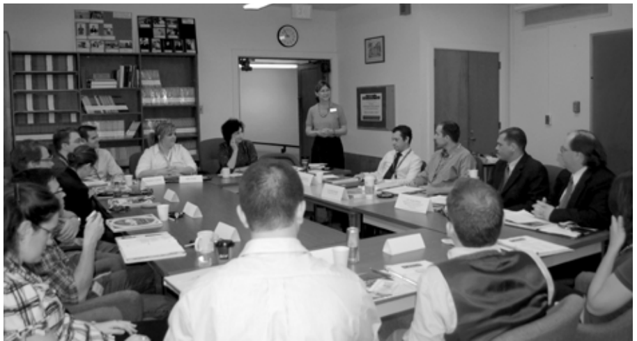
Participants of the professionalization workshop meet at the University of Kansas.