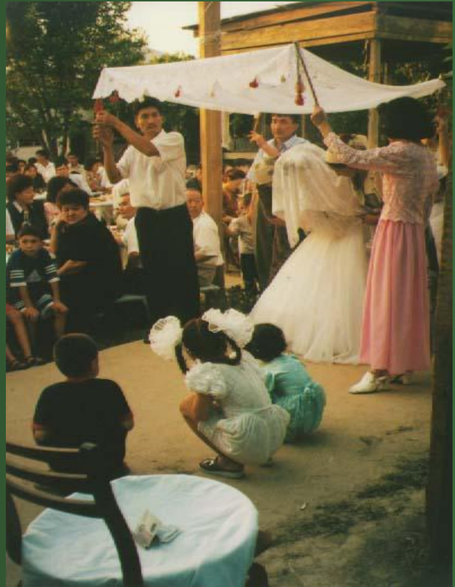
The Betashar Ceremony